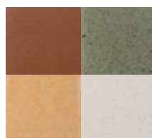
Ceramic 42 different colours