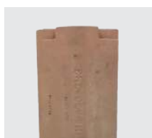
Scan-Line 800 Thermo-stones