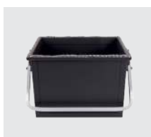
8 liter ash bucket