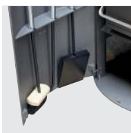
Integrated fireside tool set