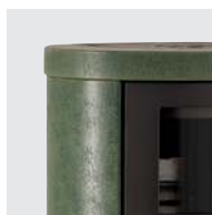
Baking oven Ceramic