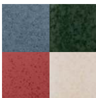
Ceramic 42 different colours